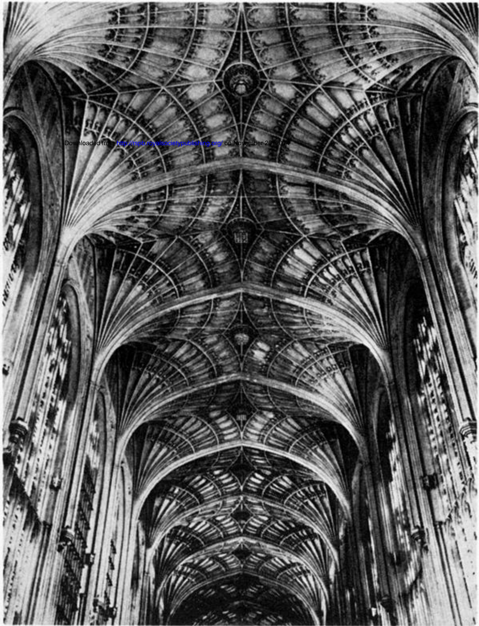
FIGURE 2. The ceiling of King's College Chapel.

Downloaded from http://rsps.royalsocietypublishing.org/ on November 26, 2014