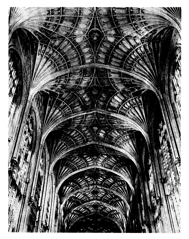
FIGURE 2. The ceiling of King's College Chapel.

the Tudor rose and portcullis. In a sense, this design represents an 'adaptation', but the architectural constraint is clearly primary. The spaces arise as a necessary by-product of fan vaulting; their appropriate use is a secondary effect. Anyone who tried to argue that the structure exists because the alternation of rose and portcullis makes so much sense in a Tudor chapel would be inviting the same ridicule that Voltaire heaped on Dr Pangloss: 'Things cannot be other than they