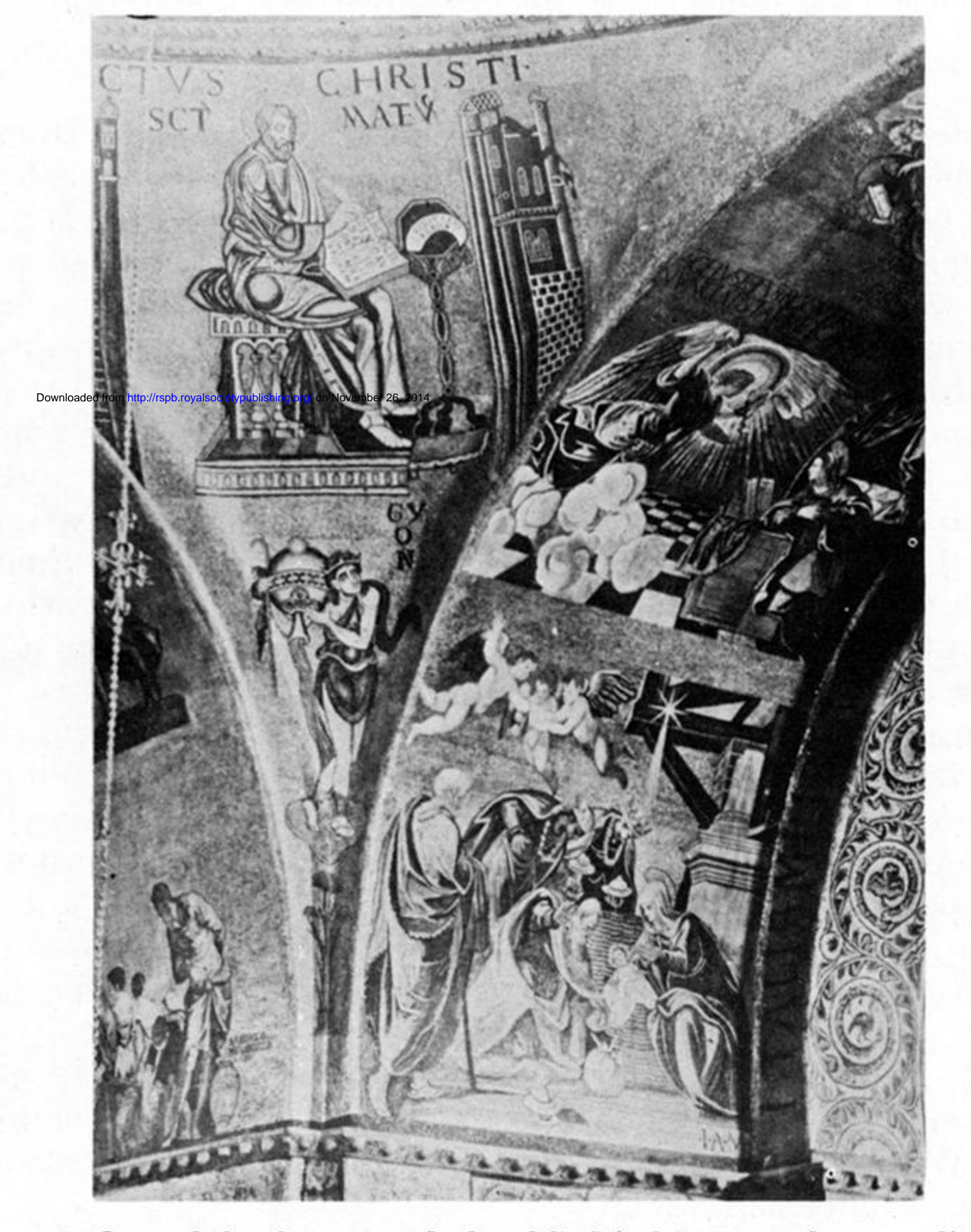
Figure 1. One of the four spandrels of St Mark's; seated evangelist above, personification of river below.