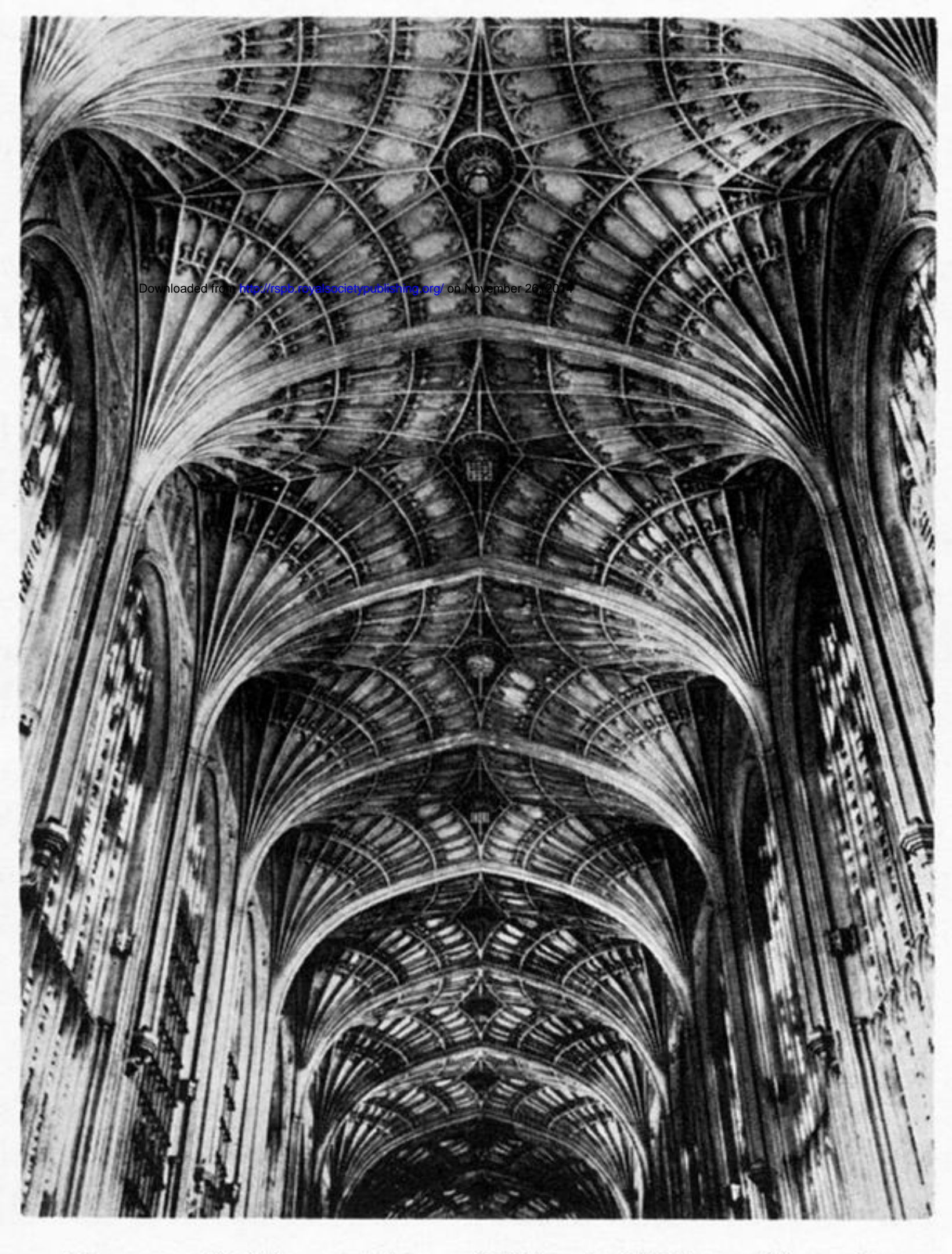
FIGURE 2. The ceiling of King's College Chapel.